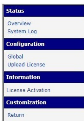
Figure 1: Menu

Left part of this GUI contains menu with Status menu section, Configuration menu section and Information menu section. Customization menu section contains only the Return item, which switches back from the module's web page to the router's web configuration pages. The main menu of module's GUI is shown on Figure 1.