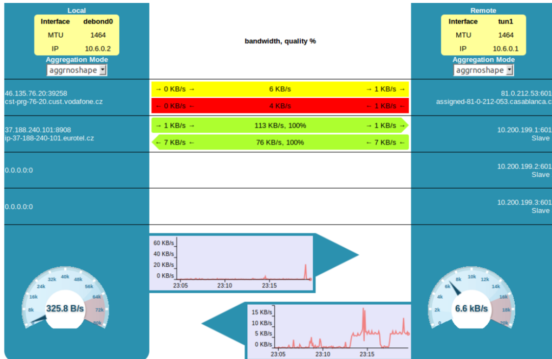
Figure 4: Monitoring

In the web interface of this user module in the Status part is available Monitoring item, which allows you to monitor the state of created tunnel and obtain statistical data.