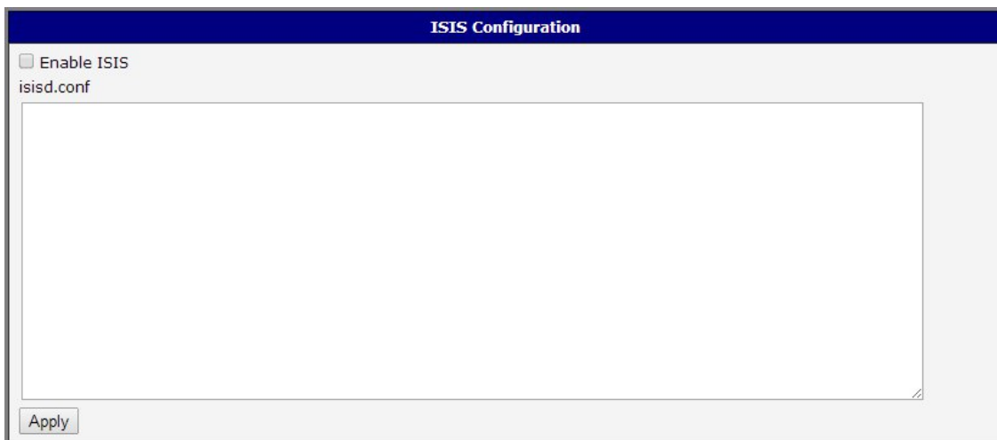
Figure 3: IS-IS web interface