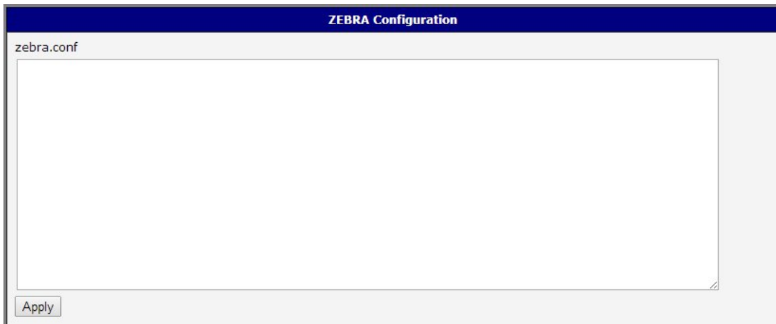
Figure 2: ZEBRA web interface